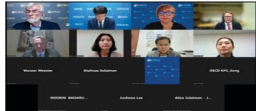
<The 13th Competition Law Seminar for Asia-Pacific Judges> Sep 18, 2023, Virtual

The Competition Law Seminar for Judges aims to provide judges in the Asia-Pacific region with an opportunity to explore the fundamentals of economics for competition law in order to elevate the understanding of judges in handling competition law-related cases, assisting them in adjudicating such cases effectively. The workshop touches on key issues, including the burden of proof and methods of economic analysis.