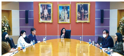
<Southeast Asia NOIG Meeting> Apr 26, 2023, OPDC, Thailand