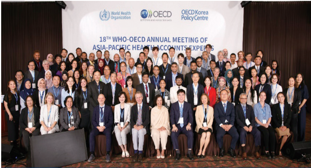
<The 18th Experts Meeting of Health Accounts Experts in the Asia-Pacific Region> Aug 29-31, 2023 Seoul

The Health and Social Policy Programme organises annual expert meetings that cover policy areas like public health, pensions, social and family policies and international training courses on the South Korean public pension system. In addition, the Programme translates and distributes the OECD's "At a Glance" series and other latest reports. Also, various research projects on health and social policies are conducted to deepen the understanding of policy issues and environments in the Asia Pacific region.