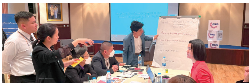
<APG Forum> Sept 25-26, 2023, Bangkok, Thailand