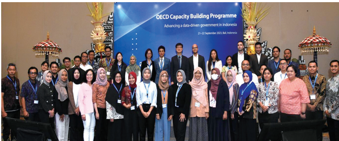
<OECD Capacity-Building Programme: "Advancing a data-driven Government in Indonesia"> Sep 21-22, 2023, Bali, Indonesia