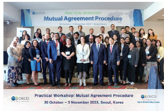
<OECD International Tax Seminar: Mutual Agreement Procedure (MAP)> Oct 30-Nov 3, Seoul