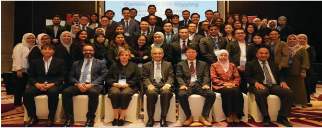
<OECD Competition Workshop: Cartels and Bid Rigging> Oct 3-5, 2023, Kuala Lumpur, Malaysia