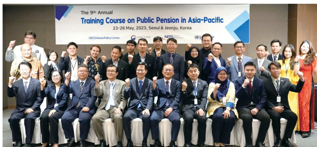
<The 9th International Training Course on Public Pension in the Asia-Pacific> 23-26 May, 2023, Seoul