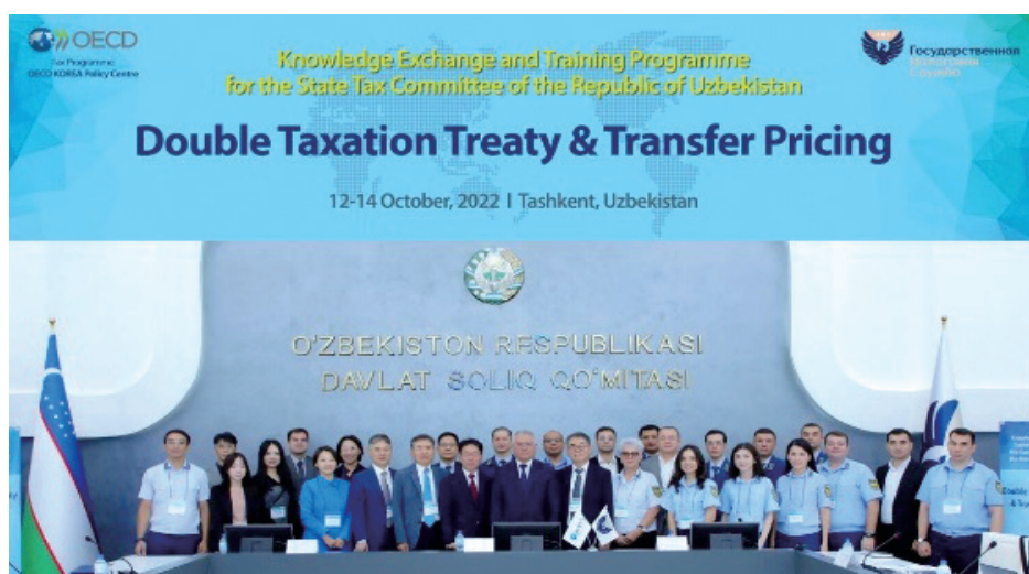
<Uzbekistan's Tax Committee(STC) Knowledge Exchange and Training: Tax Treaty and BEPS> Oct 12-14, 2022, Tashkent, Uzbekistan