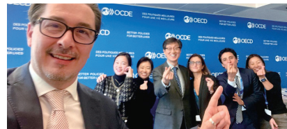
<The 68th Public Governance Committee Meeting> Oct 19, 2023, Paris, France