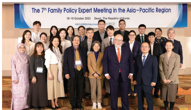
<The 7th Family Policy Expert Meetings in the Asia-Pacific Region> Oct 18-19, 2023, Seoul

The International Expert Meetings on Health/Social/Pension/Family Policy disseminate the OECD's policy trends, experiences, and guidelines for producing indexes and statistical analysis in public health and social policy to experts and government officials from the Asia-Pacific countries.