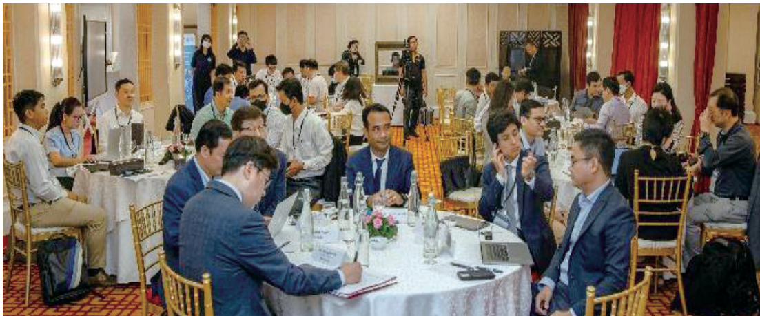
<OECD Capacity-Building Programme> May 22-23, 2023, Phnom Penh, Cambodia