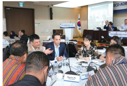
<OECD-ADB International Tax Seminar: OECD Tax Administration Database (ISORA)> Jul 4-6, 2023, Seoul