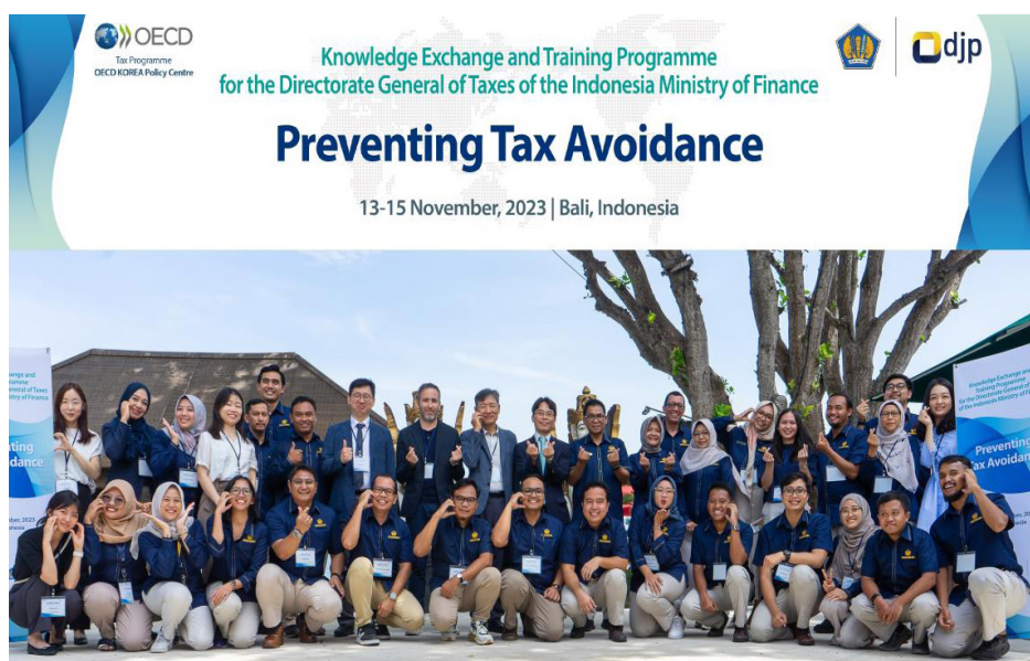
<The Directorate General of Taxes (DGT) Knowledge Exchange and Training: Preventing Tax Avoidance> Nov 13-15, 2023, Bali, Indonesia