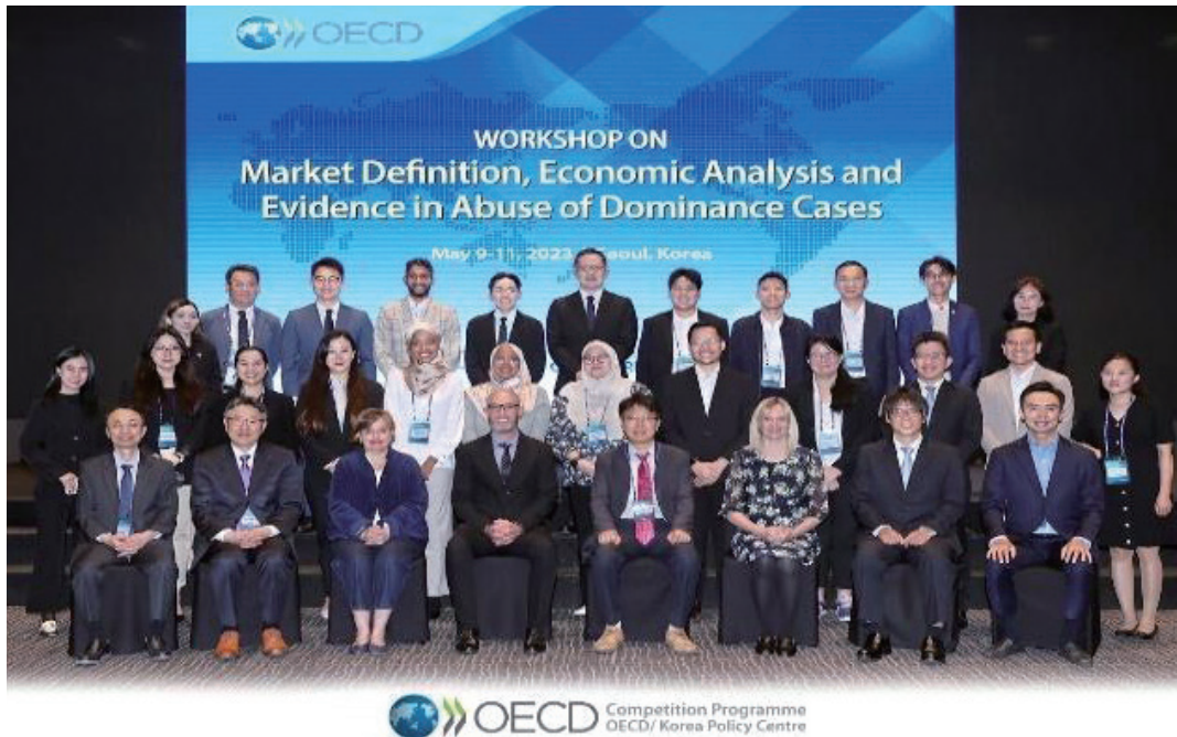
<OECD Competition Policy Workshop: Market Definition, Economic Analysis & Evidence in Abuse of Dominance Cases> May 9-11, 2023, Seoul

The Competition Programme introduces and disseminates OECD's best practices, advanced competition laws and policies to government officials and judges in the Asia-Pacific region.