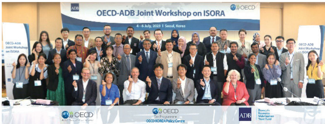
<OECD-ADB International Tax Seminar: OECD Tax Administration Database (SORA) (ISORA)> Jul 4-6, 2023, Seoul

The OECD International Tax Seminar is a platform to disseminate the latest OECD guidelines on over 20 topics, encompassing international taxation (tax treaties, transfer pricing, information exchange) and tax policy (personal income tax system, tax exemptions, taxation of small and medium-sized enterprises). Its objective is to share the policy experiences of member countries with non-member countries' tax authorities and public officials in the Asia-Pacific region. Held multiple times a year, the seminar has consistently been praised by participants for its training capacity and real-world applicability.