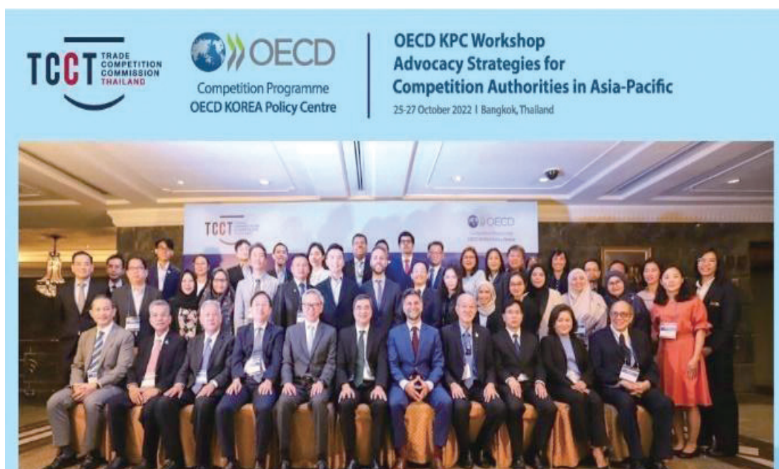
<OECD Competition Policy Workshop: Advocacy Strategies for ASEAN Countries> Oct 25-27, 2022, Bangkok, Thailand