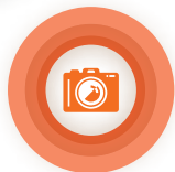
Photo Gallery p. 27

The Competition Programme of the OECD/Korea Policy Centre provides education and training to officials of Asia-Pacific competition authorities in the field of competition law and policy. This newsletter includes information about our work and the work of the OECD, as well as news, case studies and reports from competition authorities in the Asia-Pacific region.